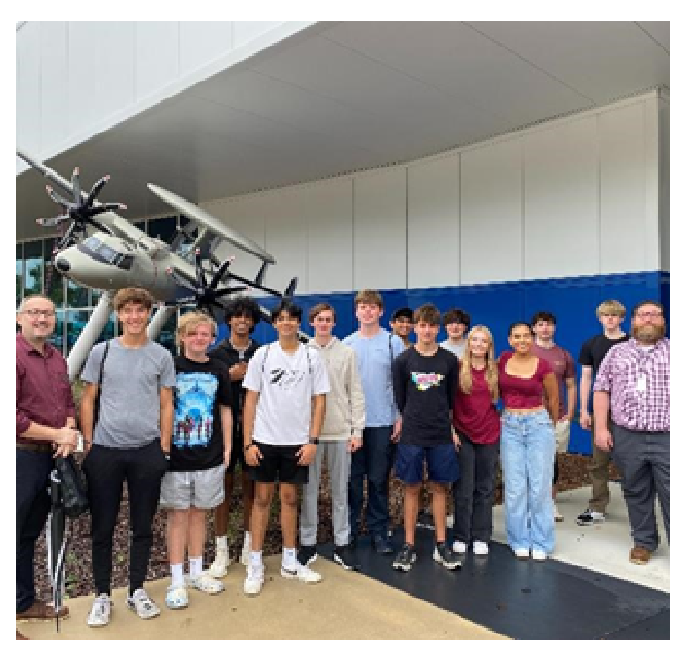
Upcoming Academy Field Trips

Stellar Academy of Engineering Juniors and Seniors joined students from Pedro Menendez and St. Augustine High School to tour the aircraft manufacturing facility at Northrop Grumman. Students were introduced to the range of craftsmen, artisans, and engineers who work together at the facility. They also learned about the paths they can take after graduation if they're interested in working at Northrop Grumman. Students enjoyed touring the manufacturing floor to see planes throughout different build stages, and had the chance to take a picture in front of an E-2D Hawkeye Model.